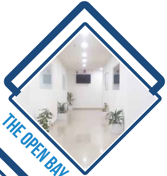
THE OPEN BAY