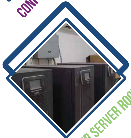
OUR SERVER ROOM